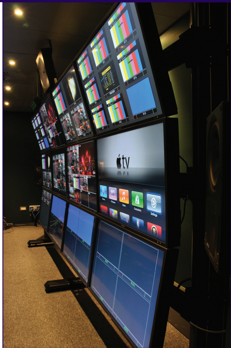
Above: Evolution Media Wall provided as a monitor mounting solution Top Left: MW desks and equipment pods installed in the Audio Room Bottom Left: MW bespoke Vision Mixing Desk