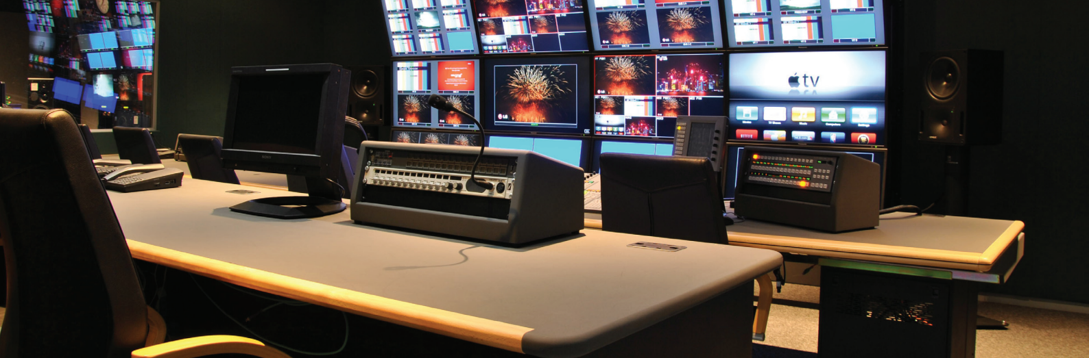
Above: New Production Studio

In each studio Evolution media walls were installed and these were powder coated black as requested by the client.