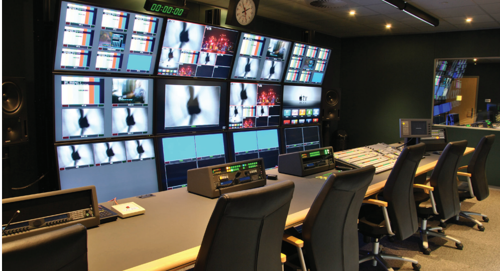
Above: New Production Studio